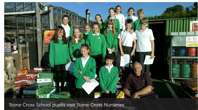
Stone Cross School pupils visit Stone Cross Nurseries

find some fantastic flowers to plant! You could even have a cup of tea whilst you are there too. We had a great time on our trip to Stone Cross Nurseries – they certainly have flower power!