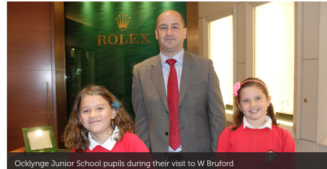
Ocklynge Junior School pupils during their visit to W Bruford