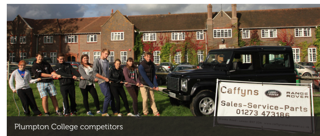
Plumpton College competitors

Students from Plumpton College recently held a Land Rover pull challenge in association with their EYR programme sponsors, Caffyns. The whole College took part, with teams from the Forestry, Agriculture and Machinery departments and the Outdoor Education team. Caffyns supplied the Land