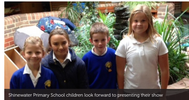
Shinewater Primary School children look forward to presenting their show

Welcome to Shinewater Primary and Nursery School! Sponsored by the Mears Group, we will host a radio show that includes songs, interviews and information about our school. Our staff and students have also chosen some of their favourite songs to share with you on the