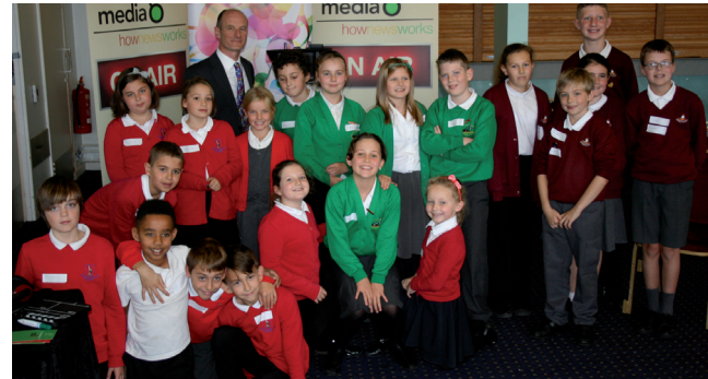
Children from local primary schools

Primary pupils were able to hone their writing, communication and teamwork skills as they were tasked with choosing three stories to be broadcast in the lunchtime news. In groups they had to choose five stories from a list of nine – in six minutes flat – but as they did so, a phone would ring with a problem, eg, a cameraman stuck in traffic, another news story would break, they were understanding how to deal with changing circumstances