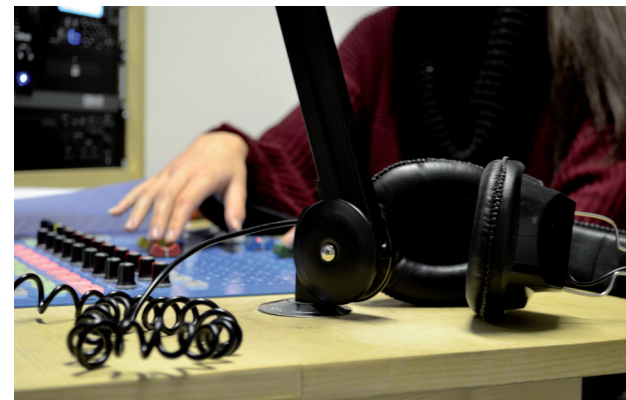
Fun in the studio

music. Twenty-five local schools, including primary, junior and secondary educational establishments will be involved, so what better way to support the youth of our community than to tune in and be amazed by the youngsters producing and performing on EYR.