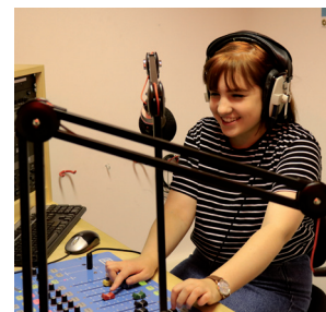
EYR is a popular event

This 3-day radio takeover provides students with first-hand experience of radio production, an excellent opportunity for those with a passion in producing, presenting, creative media and