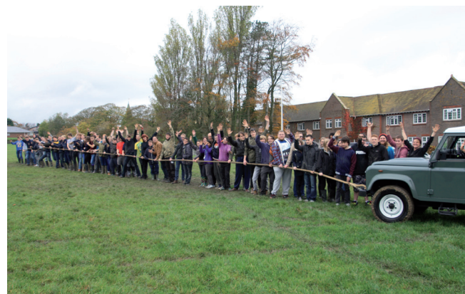
The students pulling the Land Rover